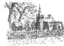
All Saints' Kingston Seymour