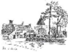
St John's Kenn